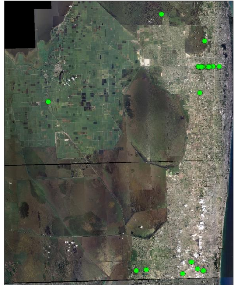
Nile monitors reports in SE Florida through June 2011