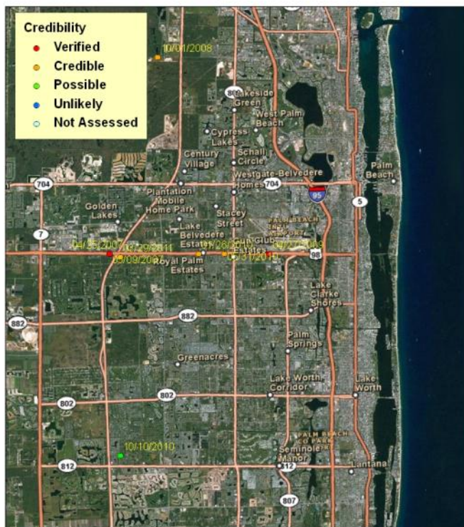
Nile Monitor ( Varanus niloticus ) FWC Non-Native Species Database 19-April-2011